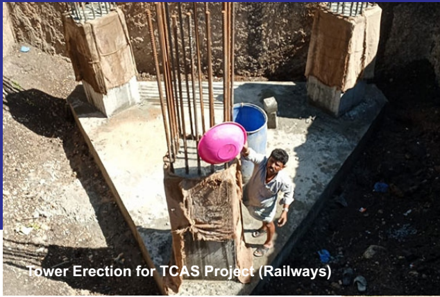
Tower Erection for TCAS Project (Railways)